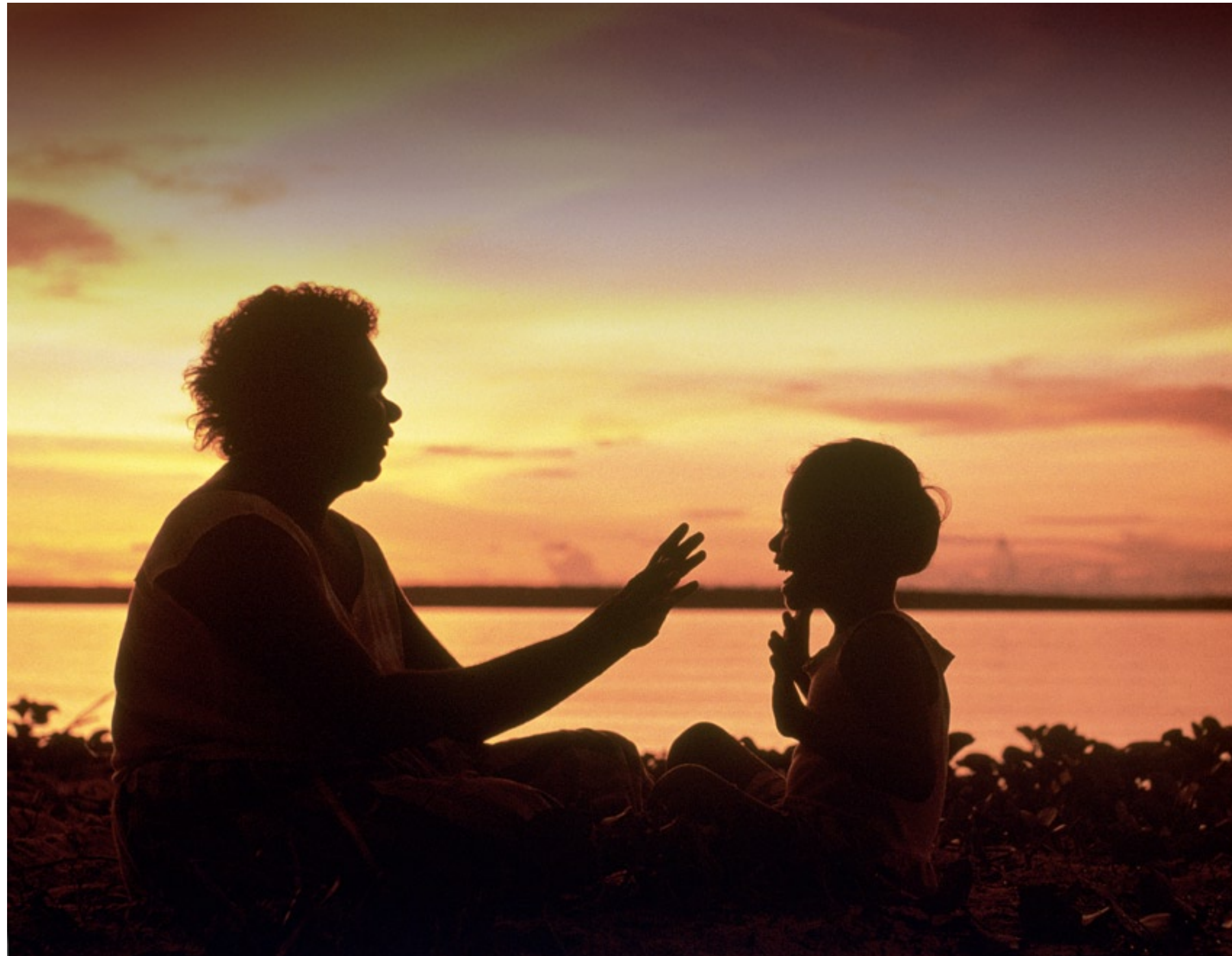
Sunset is the time for stories of long ago - and the children cannot get enough of them! This image was used for the cover of the Human Rights and Equal Opportunity Commission Bringing Them Home Report . Pirlangimpi (1988)