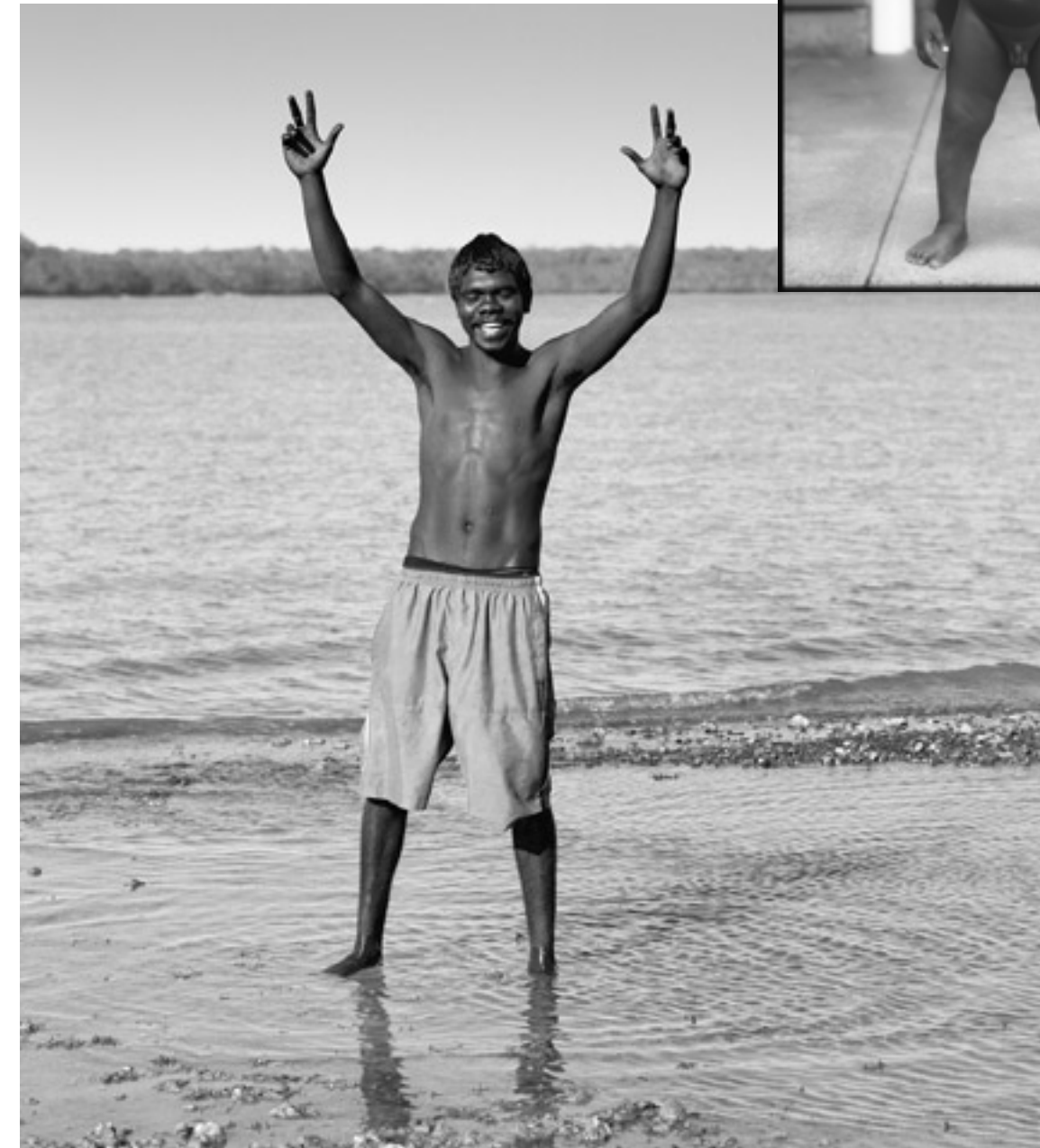
Everybody called the sturdy toddler 'Lija-Lija' in 1988. I photographed